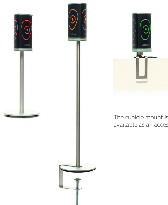
The cubicle mount is available as an accessory