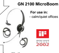
GN 2100 MicroBoom